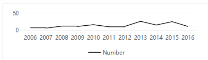
Fig. 1. Number of journals on information quality management in CNKI

In 1991, Richard Y. Wang opened a comprehensive data quality management course at MIT Sloan College, which laid the foundation for theoretical research on information quality. Over the past 20 years, information quality management tools have become increasingly mature, product defect defense capabilities have also been increased, and information quality research has never been interrupted. Figure 1 shows the number of CNKI journals on the subject of information quality management in the past decade.